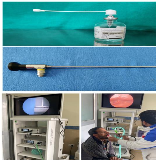
Fig 1: Picture showing different instruments, position, procedure and local anesthesia used

Patient was made to sit on a chair. Usually no topical anesthesia was required; however 10% xylocaine spray was applied to the base of tongue and the posterior pharyngeal wall if there is over sensitive gag reflex. The doctor stands in front of the patient while he was bending slightly forward with slight extension of the head. The tongue of the patient is pulled out with left hand using a piece of gauze and with his right hand the scope lens was facing down and introduced forward through the oral cavity avoid touching the tongue. In case of any difficulty to examine anterior commissure area of the larynx, extension of the head was increased, the endoscope handle was further elevated to make its shaft touches the upper incisors and the tip of the scope is slightly further advanced to aid viewing these area. To evaluate all parts of the larynx, the scope was half rotated to the sides. Video movies were recorded for every patient. Picture of the findings can be done when needed.