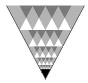
Figure 1. Convergent Thinking Model (Fry, 2007)

Convergent thinking is oriented towards giving the best or clear answer to the question. It emphasizes accuracy and logic as well as focuses on applying familiar skills in problem-solving. Convergent thinking is therefore most effective in situations where answers exist. Convergent thinking leaves no room for ambiguity, so the answers are either right or wrong. Convergent thinking is closely related to knowledge. On the one hand, it applies existing knowledge, on the other hand, it expands knowledge (Fazelipour et al. 2008). Convergent thinking is the ability to use logical thinking, evaluation, critical thinking, and narrowing down the ideas that are most relevant to the problem posed. Convergent thinking emphasizes individuality, precision, and science. Convergent thinking is at the core of engineering processes (Fry, 2007).