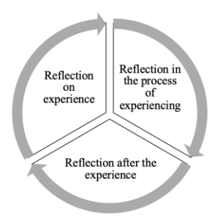
Figure 3. Model of Reflective Thinking Stages in Class (Choo et al. 2019)