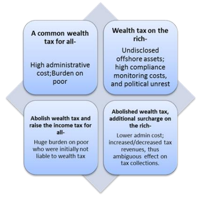
Figure 3: Possible direct tax strategies for a country with a legislated wealth tax