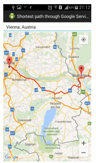
Figure 3: Optimized path and drawn on Google Map through poly lines

Based on returned results from Directions Google Service, I map the path on Google Map through poly lines.