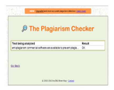
Image 4 – Step 3: processing and scanning the work from its databases