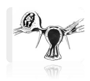
Figure: Dark Spot Shows Growth of Tissues on Irrelevant Areas