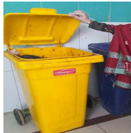
Figure 6. Hospital waste Rahat Hospital