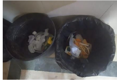
Figure 2. Hospital waste Rahat Hospital