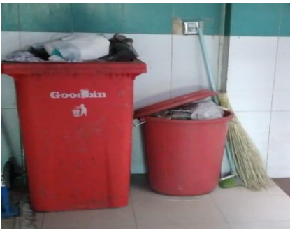
Figure 3. Hospital waste Rahat Hospital