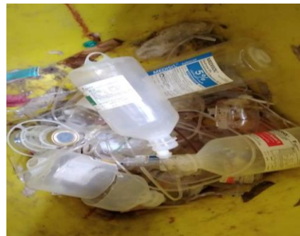
Figure 4. Hospital waste Rahat Hospital