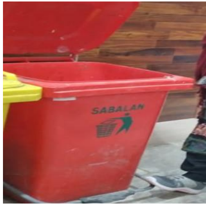
Figure 7. Hospital waste Rahat Hospital