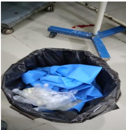
Figure 5. Hospital waste Rahat Hospital