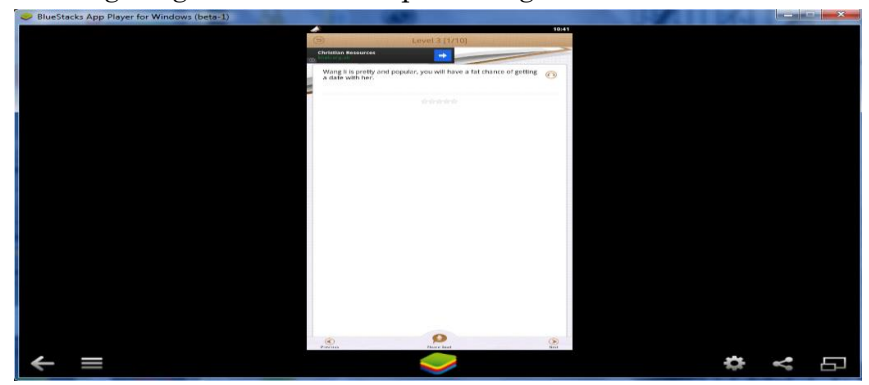
Figure 2: English Pronunciation testing opening window