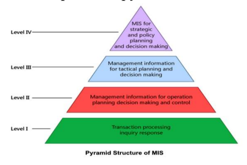
Fig. 1- Pyramid Structure of MIS

MIS plays a very important role in any organization and having very wide scope because Management Information System study whole information about society and individual. To be shown and clarified the way MIS, it can be seen on four different layers as depicted in pyramid structure - figure 1: