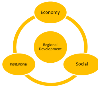
Figure 2. Three factors play a role in the Regional Development of Public Welfare

Figure 2 shows that there are three factors: economic, social and institutional development of regions that play a role in the welfare of rural communities. The third factor is a unity that cannot be separated in the utilization of regional development efforts to improve people's welfare.