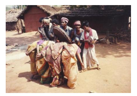
Figure 3 Juang dance in kansa village