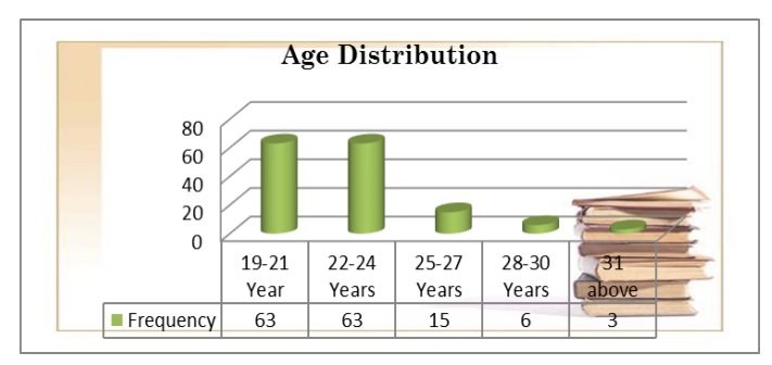
Fig.1 Age Distribution of the Respondents